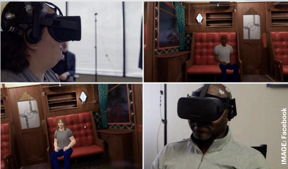
Figure 6: Strangers meeting and talking to each other in a virtual room using Facebook’s Oculus Rift VR headsets

“It was a lot deeper, and enjoyable, and closer to life than I expected,” said one 43-year-old male participant. “We moved from two strangers having the same (superficial) conversation to two humans revealing themselves and their experience of life.” 7