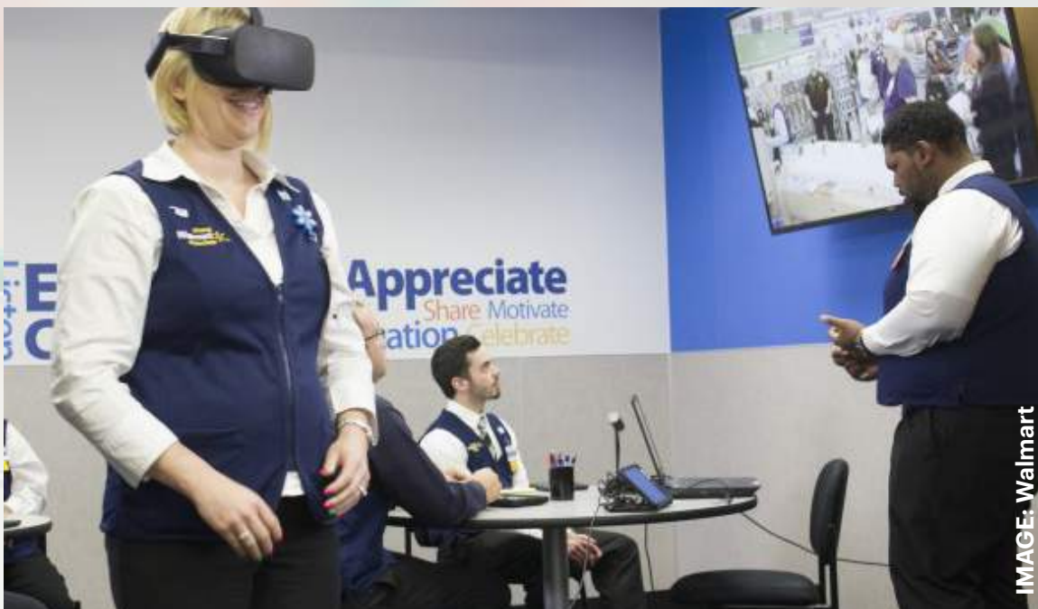
Figure 3: A Walmart employee undergoing situational training using a VR headset

In each training session, trainees' headsets are hooked up to a large screen so the rest of the classroom can see what they are seeing, while a teacher critiques their actions. In addition, the headset records the eye-movements of the trainees, giving valuable feedback to the program creators about how the users are engaging with the content. As a result, 70 percent of trainees who used VR did better on their learning evaluation exams versus those who didn't. The VR trainees also reported a 30 percent increase in overall training satisfaction, compared to the non-VR trainees.