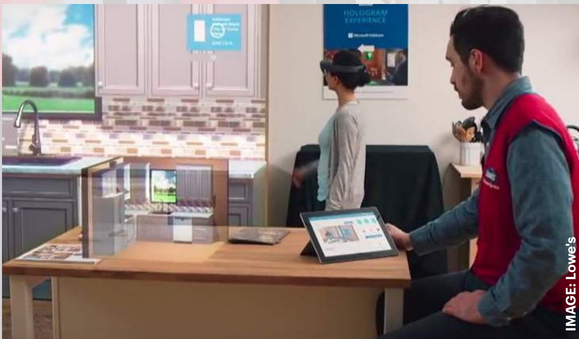
Figure 5: A Lowe's customer viewing a virtual kitchen with features being customized in real-time by an employee

For Lowe's customers, the HoloLens mixed reality experience helped take the guesswork out of a renovation project and gave them the ability to visualize the options they had to choose from. By providing this experience, Lowe's removed one of the biggest obstacles to buying their products: the fear that it could all turn out wrong.