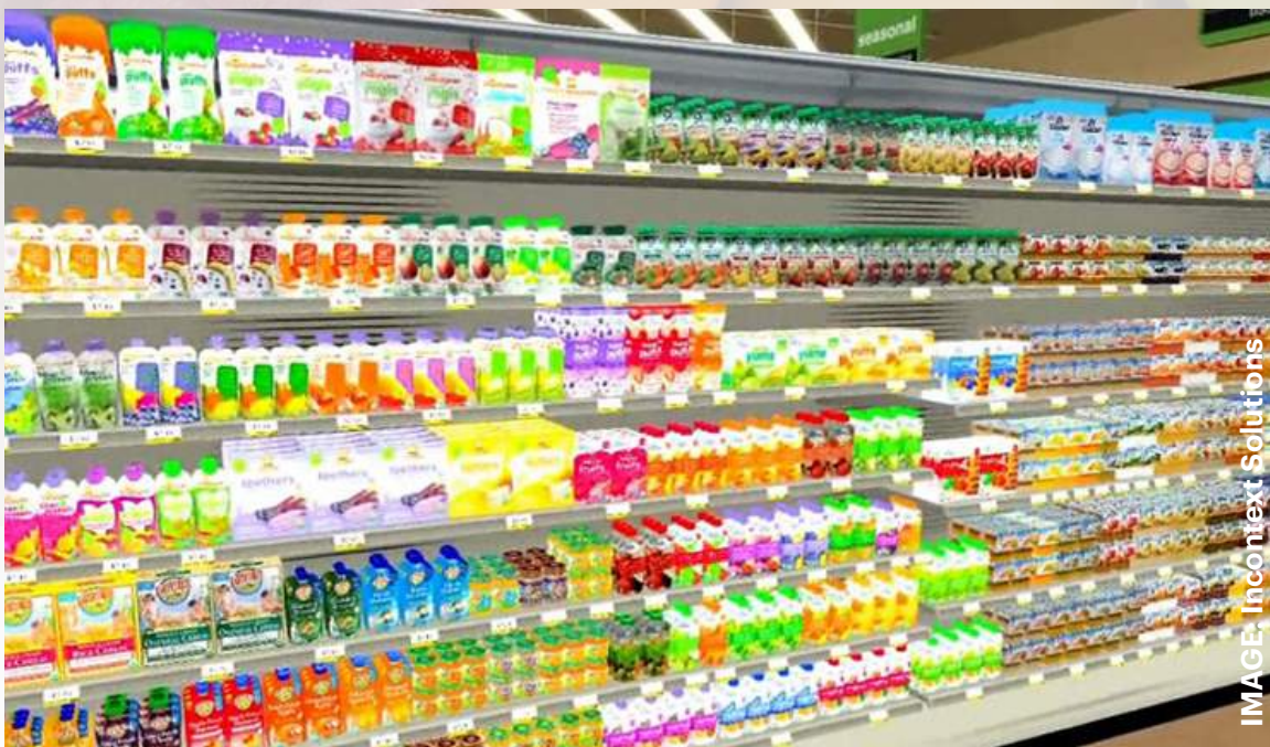
Figure 4: A virtual shopping aisle created to test shoppers of Happy Family baby foods

Remarkably, setting up the entire test took only three and a half months from the time the initial idea was conceived to the day the first virtual test was conducted, further highlighting the speed and effectiveness of using virtual tech to gain real-world insights.