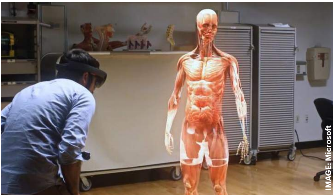
Figure 2: Medical students can view and interacts with a 3D image of the human body through Microsoft's HoloLens

In some cases, it's cheaper to simulate and control the entire training environment using VR, rather than project it onto a real environment like we do in MR. For example, a leading airline decided to train its technical operations team using virtual reality headsets because it was cheaper than getting access to a real aircraft.