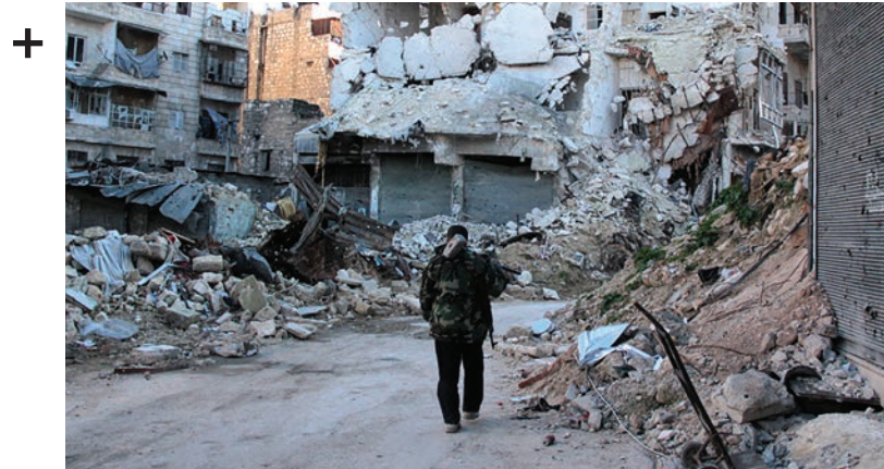
Aleppo, Syria.