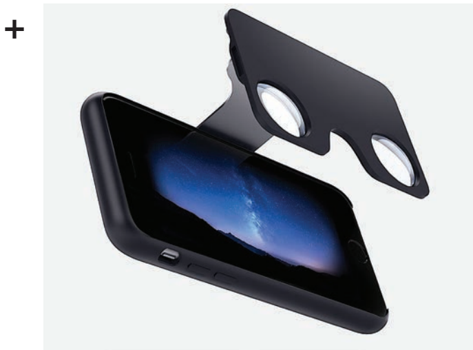
Figment VR.

Today, Google, Samsung, HTC, Sony and other companies have been working on their own headsets. Industry analysts are predicting that up to 34 million headsets will be sold in 2020. By 2020, Digi-Capital predicts that the augmented and virtual reality market may reach $150 billion in sales. One small company, Quantum Bakery, had a successful Kickstarter campaign for a mobile phone case that pops up into a VR viewer; it plans to release the device in 2016.